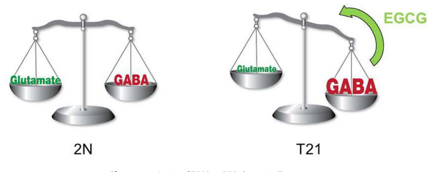
Figure 2. Action of EGCG on E/I balance in a T21 context.

were reversed in the Dyrk1a<sup>+/-</sup> model (Souchet et al., 2014). Dyrk1a overexpression produced an increased number and signal intensity of GAD67-positive neurons, indicating enhanced inhibition pathways in three different models: mBACtg Dyrk1a , hYACtg Dyrk1a , and Dp(16)1Yey. Functionally, Dyrk1a overexpression protected mice from PTZ-induced seizures related to GABAergic neuron plasticity (Souchet et al., 2014). Dyrk1a overexpression also affects pathways involved in synaptogenesis and synaptic plasticity and tips the E/I balance toward inhibition (Souchet et al., 2014).