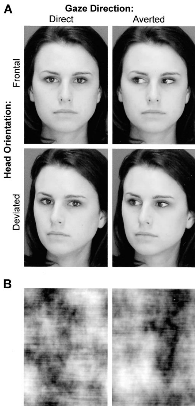
Figure 1. Example of stimuli. Subjects were shown color images of faces that either looked straight at the subjects (eye-contact condition) or away to either side (averted gaze) ( A ). The faces were counterbalanced for gender, head position, and, for non-eye-contact images, gaze direction (right or left). Half of the faces had the gaze directed at the subjects and half away to the side. B , Random examples of scrambled images derived from the stimuli above. These were presented before and after each stimulus face to avoid changes in pupil diameter attributable to luminance changes.

Visual stimulus preparation and presentation. Forty faces (half male, half female) were photographed with the subjects looking either straight into the camera or at a point deviated horizontally by 30°, using a digital video camera. Facial expression was neutral. We expected that the predicted effect of seen gaze direction should be found independently of head orientation (George et al., 2001). Thus, for both gaze directions two views were taken (head frontal or head deviated to the side by 30°). Scrambled, nonface control images were derived using an in-house pro-