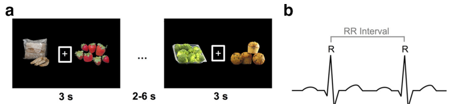
Figure 1. Behavioral and physiological measurements. a , In the dietary self-control task, participants made on the screen a series of choices between two items that represented items they would eat at the end of the study. In the challenge trials that are the focus of this paper, choosing the healthier food required forgoing the tastier option. b , This stylized sketch highlights the R peaks of the ECG curve. The RR interval describes the distance between two subsequent R peaks. In the healthy heart, the length of subsequent RR intervals consistently differs on the order of milliseconds, which enables HRV characteristics to be calculated.

We measured baseline heart rate at rest with the Polar RS 800 CX system [for a cross-validation of this method with echocardiogram (ECG), see Quintana et al., 2012]. All measurements were collected between 1:30 P.M. and 5:00 P.M. to control for circadian rhythms (Heathers, 2014). The baseline measurement was always taken in a single session before any stress or control treatment was administered. Participants were seated in a quiet room and instructed that upon mounting the Polar watch and pressing start, they would need to sit upright and remain quiet and calm during the subsequent baseline-recording interval. A baseline recording was taken for 6 min. The first 3 min of the recording were discarded from the analysis to yield a set of data that were less affected by such factors as initial motion while acclimatizing to the recording environment (Quintana et al., 2016). We focused on baseline (i.e., resting) heart-rate measures to obtain a domain-general index of HRV.